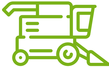
Mechanized farming operation