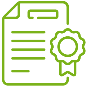
Land Title Documents