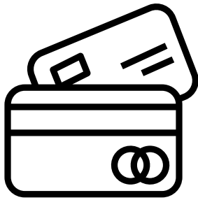
Automated Payment processing for different stakeholders in the scheme